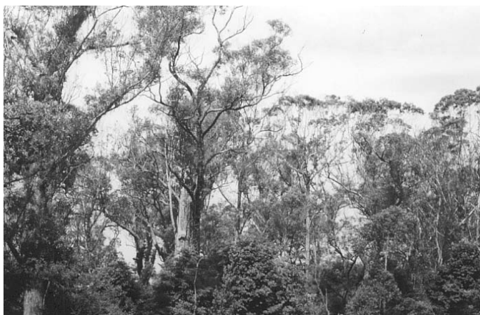
Figure 1. Dieback in old-growth blackbutt

application. Ellis and Pennington (1992) concluded that ‘high-altitude’ dieback of alpine ash ( E. delegatensis ) and succession to rainforest was associated with soil microbial factors developing in a cool moist environment in the absence of fire.