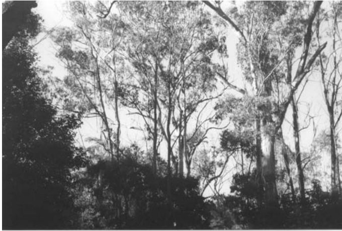
Figure 2. Dieback in the ‘grassy ecosystem’ — ‘Bega Wet Shrub Forest’ (Keith and Bedward 1999)

increases the population vigour of arboreal folivores. In this situation, a combination of unhealthy roots and increased and repeated pest attack in crowns, results in dieback.