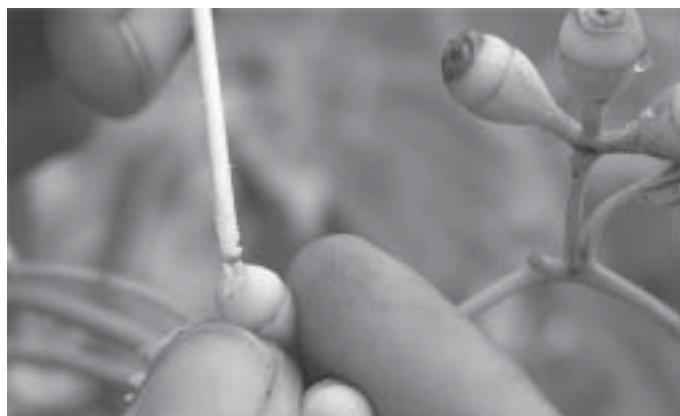
Figure 2. Flower of the interspecific hybrid E. grandis × E. urophylla being pollinated following AIP treatment