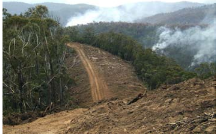
Figure 2. A strategic break prepared to contain a back-burn, Swampy Creek, north of Bairnsdale, Victoria (Photo: Greg McCarthy, Bushfire CRC, December 2006)

In some respects this major study is only quantifying what the field forester, the bushman and the aborigines before them have known from practical observation: if you reduce the quantity and amount of fuel you will reduce the rate of spread and intensity of a fire and make it easier to control. And now that the role of forestry agencies as a manager of native forests has been greatly reduced, and forestry research has been decimated in the states