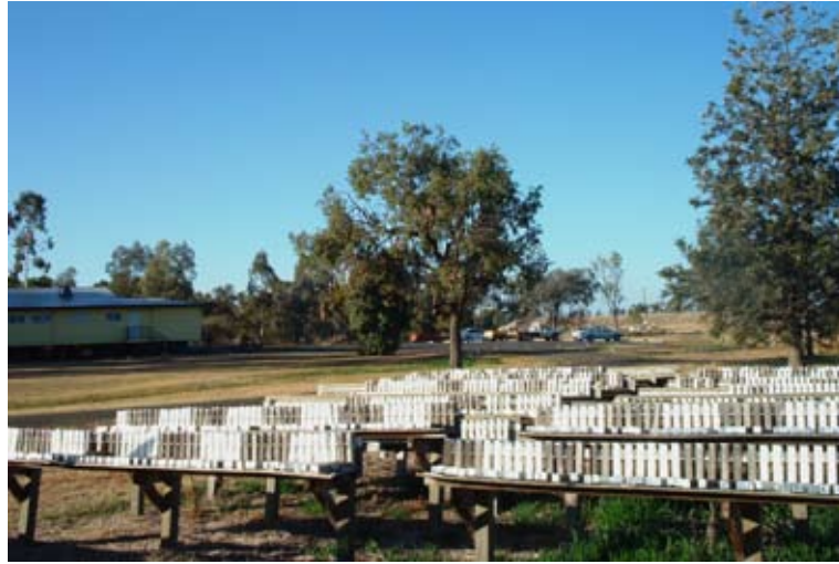
Figure 2. Dalby exposure site