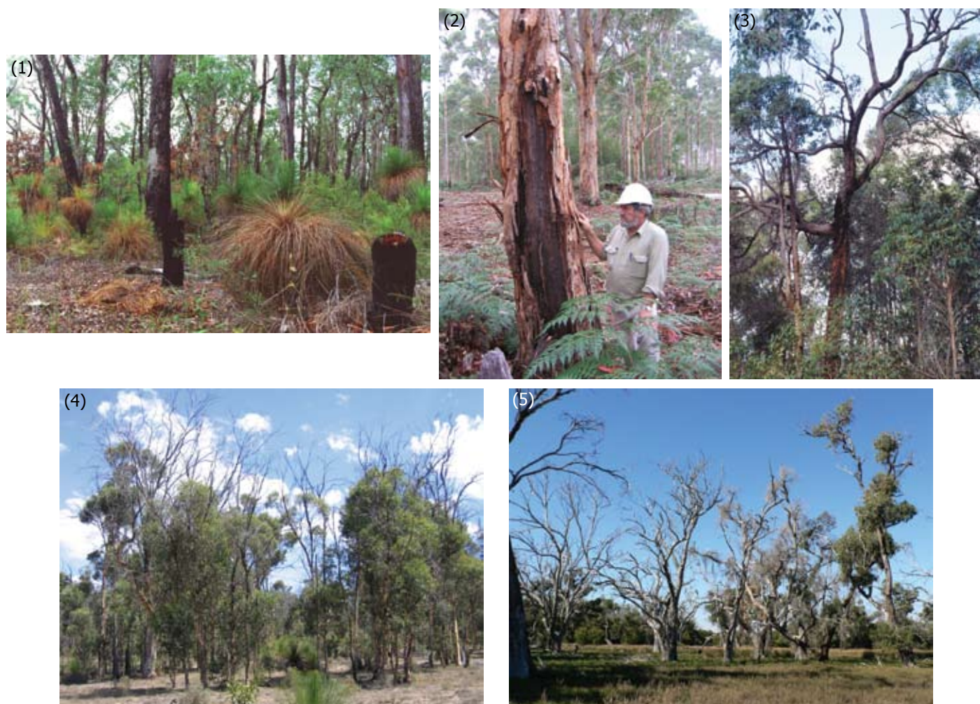
Figure 1. A disease front in jarrah forest infected with Phytophthora cinnamomi . Dead and dying Xanthorrhoea preissii and Banksia grandis and the almost total lack of understorey in the foreground indicate the disease boundary. Figure 2. Scar on the stem of a 30-y-old karri tree caused by Armillaria luteobubalina infection. Figure 3. Recently dead marri as a result of canker caused by Quambalaria coyrecup . Figure 4. Wandoo at Wundabiniring Brook showing symptoms of crown decline. Figure 5. Dead and declining tuart near Lake Clifton.