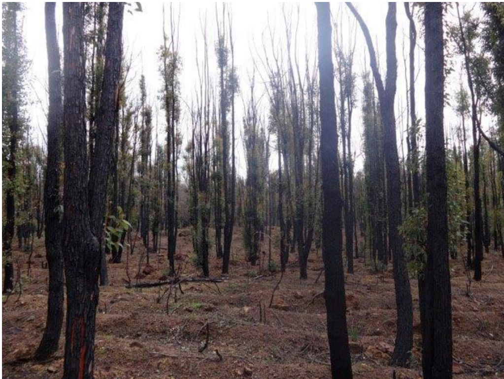
Fig 6. Rehabilitated bauxite pit burnt during Waroona/Yarloop bushfire, January 2016.

These factors increase both the cost and the risk of bushfire management to staff and have contributed to a steep increase in the vulnerability of the northern jarrah forest to high intensity bushfires such as the recent Waroona/Yarloop wildfire. In his review of this wildfire, Commissioner Ferguson noted the difficulty of fire suppression in post-mining landscapes was a contributing factor to the burning of the town.