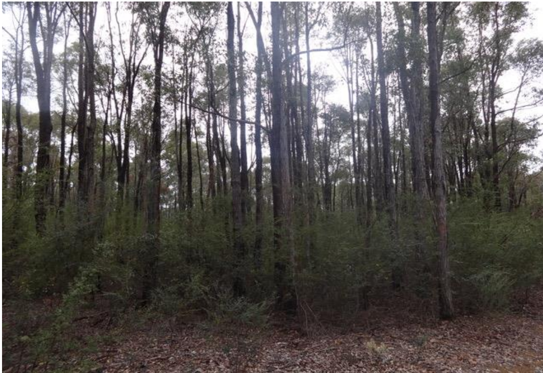
Fig 4. Rehabilitated bauxite pit showing dense jarrah and understorey vegetation in need of thinning.

Mining and revegetation greatly alter the hydrology of the mine-pits and adjacent forest. After the bauxite layer (3-5 m in depth) is removed, the pits are shaped to retain water, the clay subsoil is deep-ripped to enhance infiltration, the top-soil is returned to the site and the areas are fertilized. They are then seeded with a mixture of native eucalypt and understorey species. The result is a dense stand of fast -growing species with very high water use (see Fig 4).