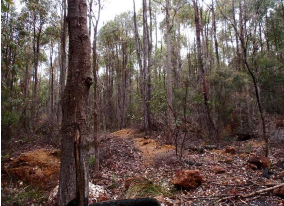
Fig 5. Unattractive rehabilitated bauxite pit showing uneven surface and boulders.