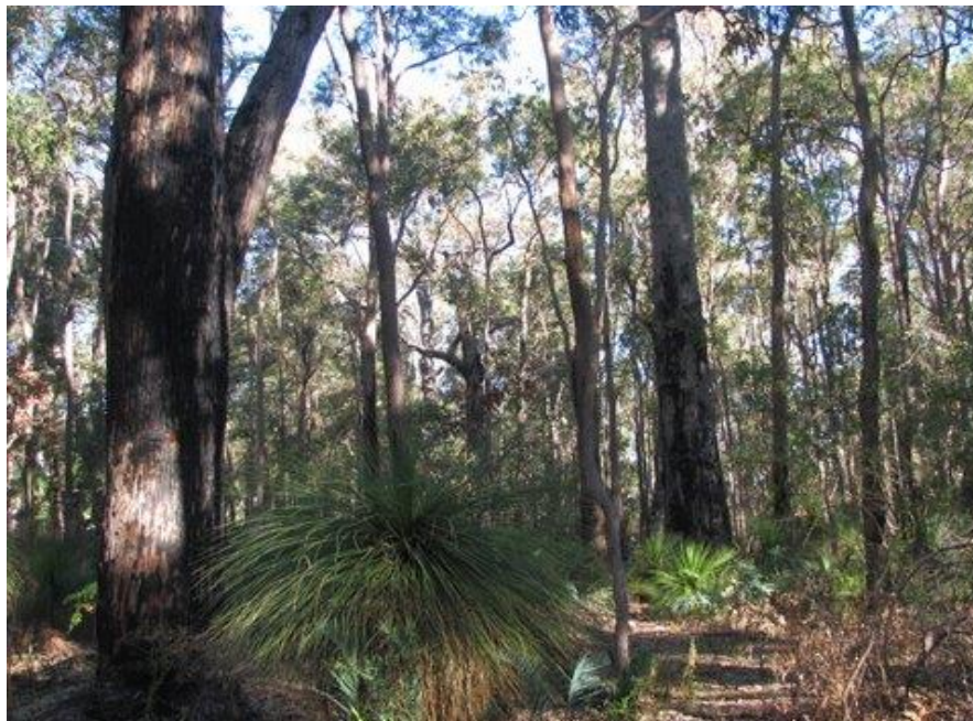
Fig 3. Example of high-quality jarrah forest in north which warrants reservation before it is mined for bauxite.

There are few Comprehensive, Adequate and Representative (CAR) reserves in the high-rainfall, high-quality jarrah forests north of Collie, although they are well represented in the southern forests. An adequate representation of CAR reserves is a requirement under State/Federal agreements. The current lack of suitable reserves in the northern jarrah forests is due to opposition and successful political lobbying by bauxite companies. There are still areas of high-rainfall, high-quality jarrah forest in the north which would be very suitable as CAR reserves (see Fig 3), but action is required soon before these areas are also mined.