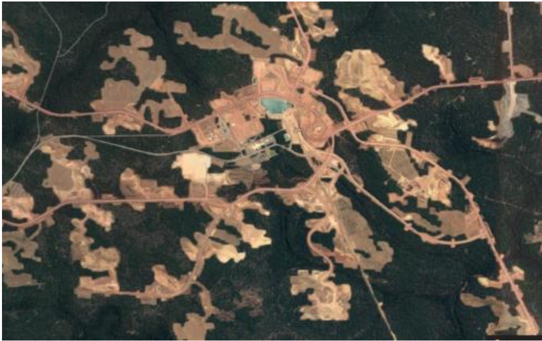
Fig 1. Aerial view of example of current bauxite mining operations in northern jarrah forest.