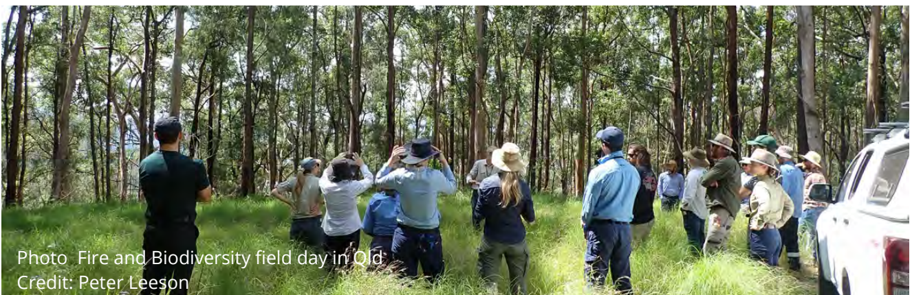
Photo: Fire and Biodiversity field day in Old