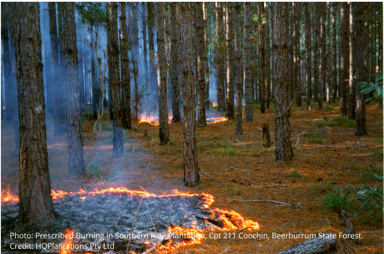
Photo: Prescribed Burning in Southern Pine Plantation, Cpt 211 Coochin, Beerburrum State Forest.