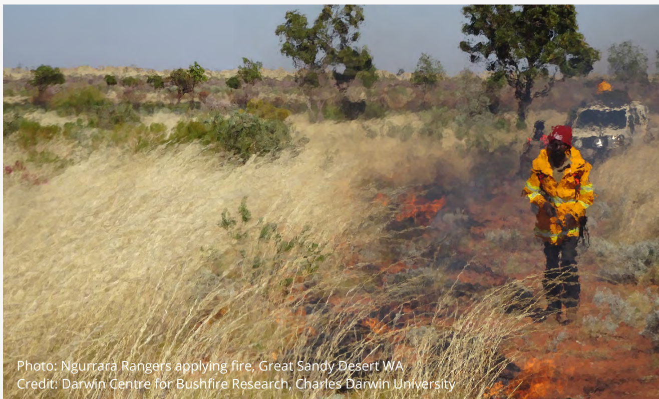
Photo: Ngurrara Rangers applying fire, Great Sandy Desert WA