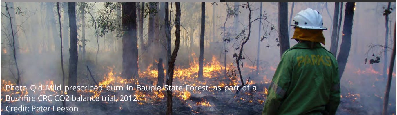
Photo Qld Mild prescribed burn in Bauple State Forest, as part of a Bushfire CRC CO2 balance trial, 2012.