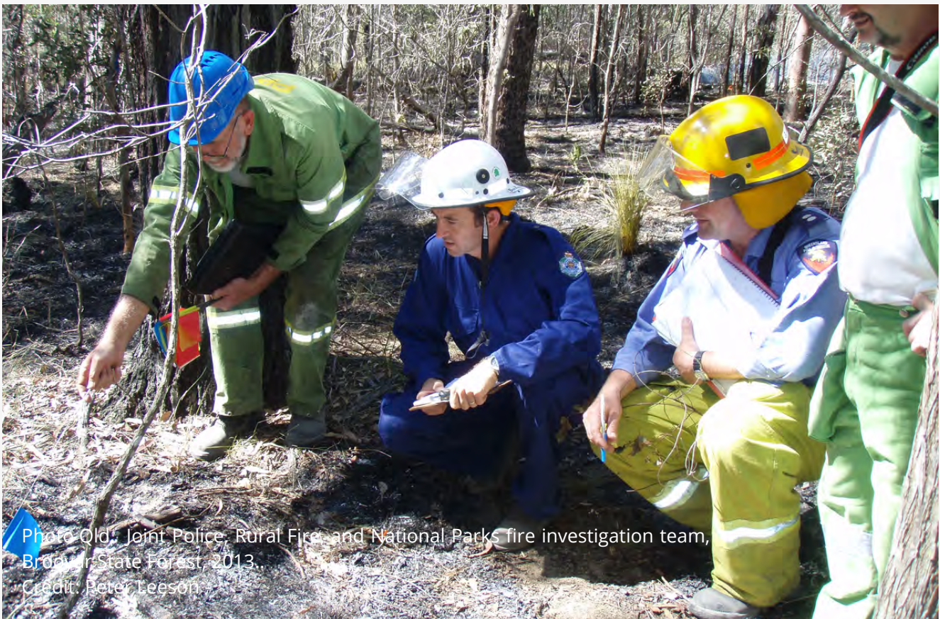
Photo: Old, Joint Police, Rural Fire, and National Parks fire investigation team, Brindley State Forest, 2013.