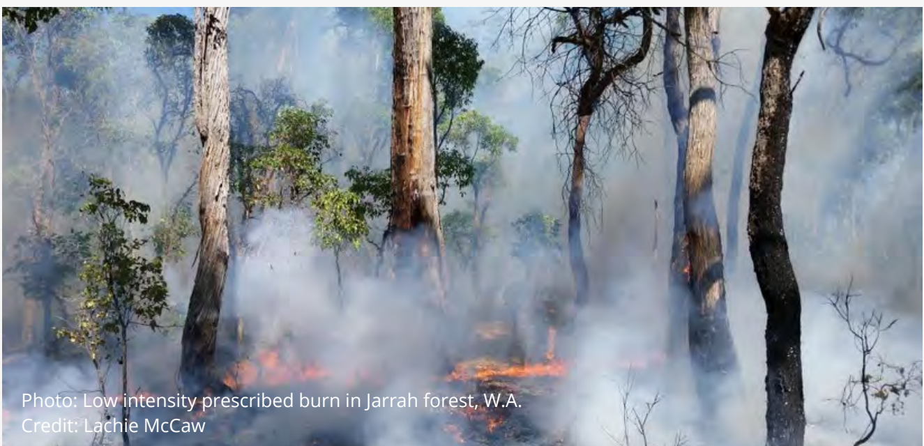
Photo: Low intensity prescribed burn in Jarrah forest, W.A.

*For brevity, any reference to "forested" areas in this document includes all types of forests, woodlands, shrublands and rangelands. "Forested" is used broadly and inclusively.